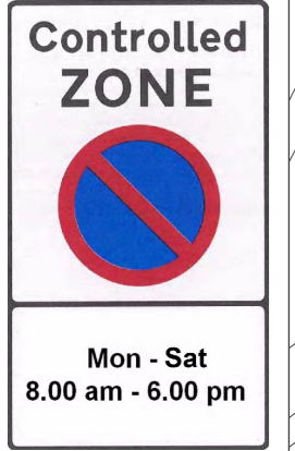
Example Type 1 Entry Sign to indicate parking for Permit Holders as well as Pay and Display users.

This map is our proposed initial layout. If you have any comments about the detail you should include these in the questionnaire. If possible and practical we will make changes to the layout depending on your comments. We will then take this to your community representative to agree the final layout.