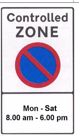
Example Type 1 Entry Sign to indicate parking for Permit Holders as well as Pay and Display users.

This map is our proposed initial layout. If you have any comments about the detail you should include these in the questionnaire. If possible and practical we will make changes to the layout depending on your comments. We will then take this to your community representative to agree the final layout.