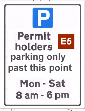
Example Type 2 Entry Sign to indicate parking for Permit Holders only.